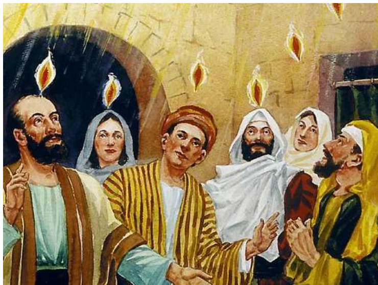
At Pentecost the Holy Spirit came like flames of fire to dwell in believers, uniting them with Christ and distributing various spiritual gifts