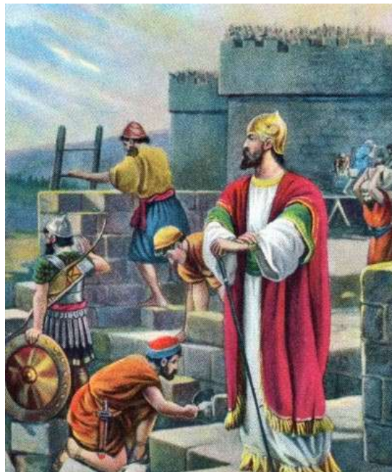
Nehemiah and the Israelites prayed, set to work and kept a guard against enemies.

[ He then organized their work, reminded them of God's power, and served as an excellent example of a hard worker. ]